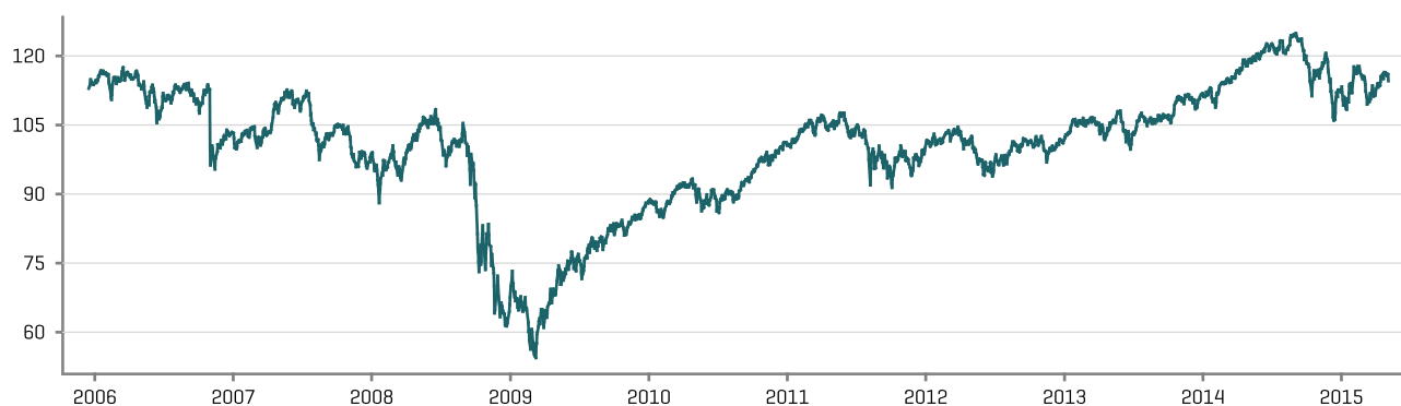
■ S&P/TSX Composite High Dividend Index