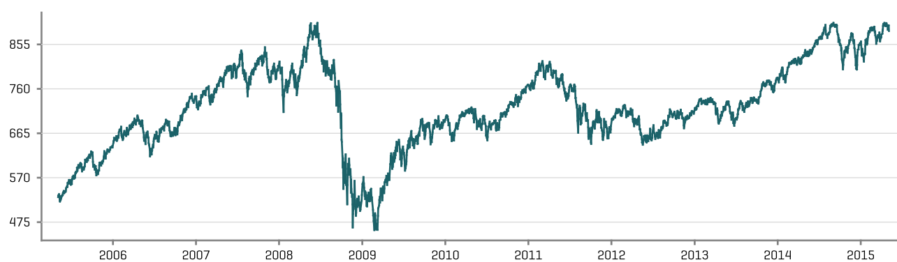
■ S&P/TSX 60 Index