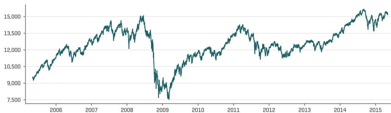
■ S&P/TSX Composite Index